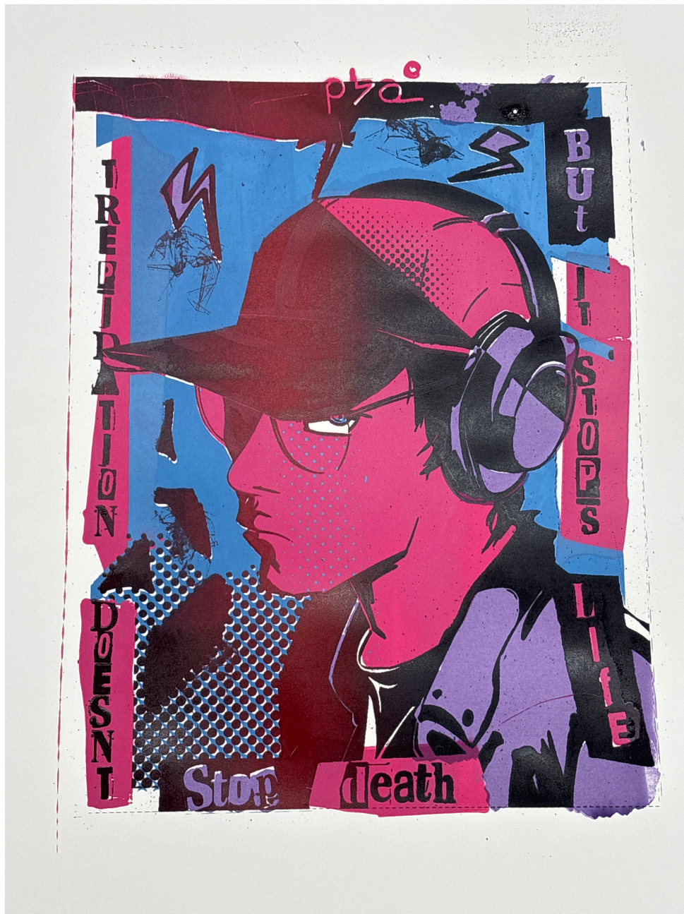
Kiyaw Bird Full Life Silkscreen Print

Copyright 2025. These works are distributed under a Creative Commons Attribution Non-Commercial 4.0 license. ( https://creativecommons.org/licenses/by-nc/4.0/ )