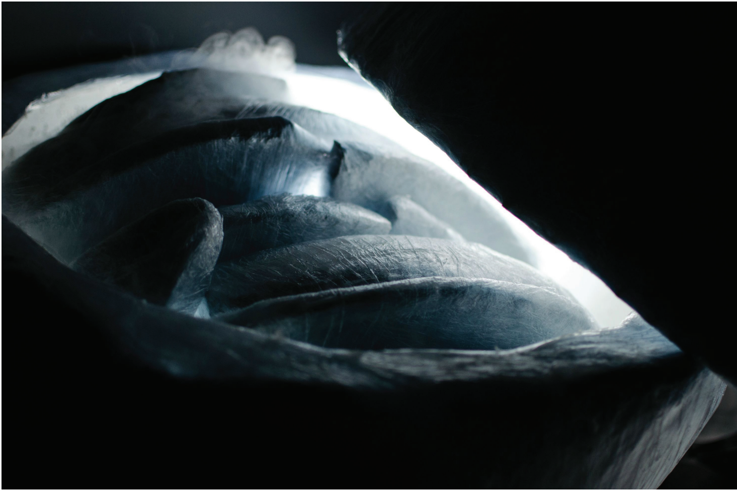
eclipse, 2014 plaster, burlap, aluminum foil, plastic wrap