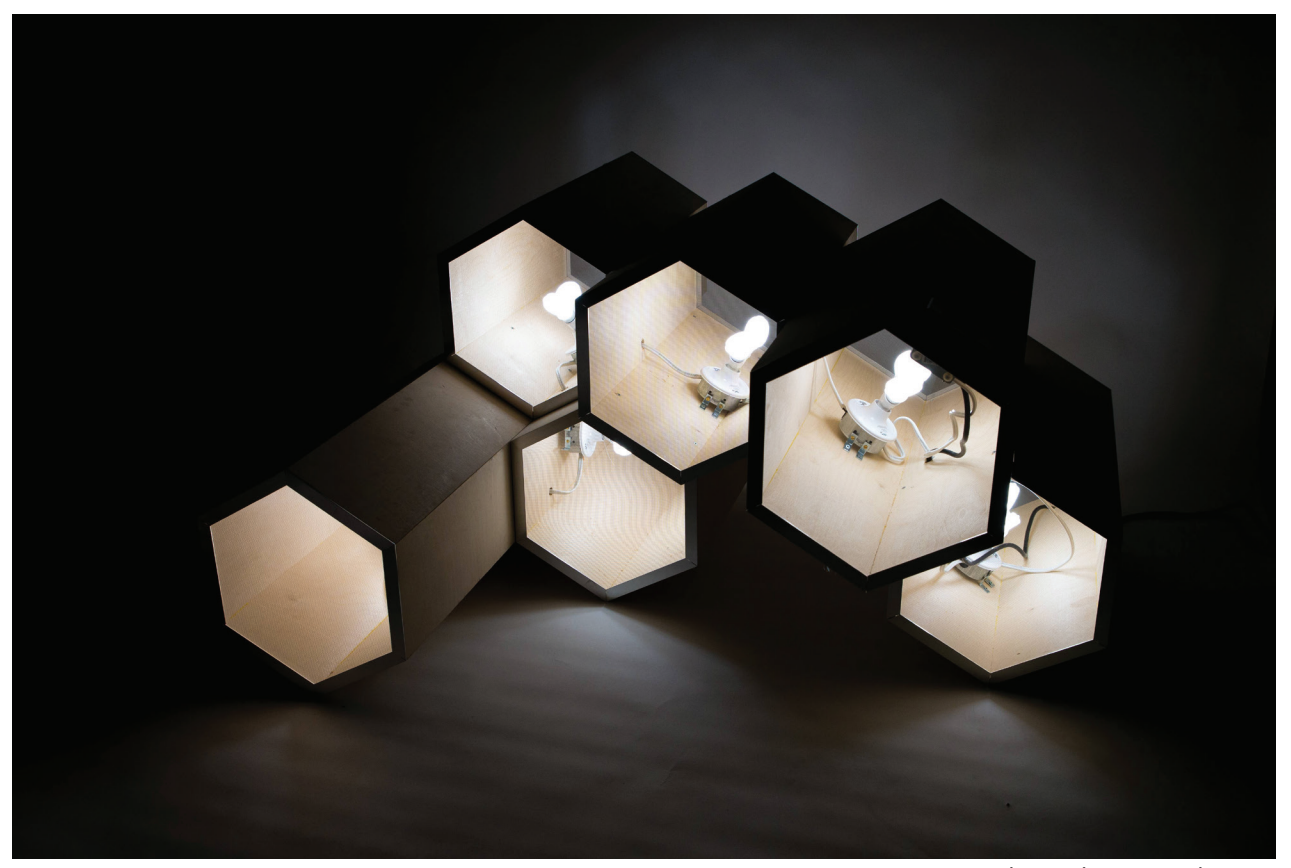
electric honeycomb, 2015 plywood, electrical components, aluminum