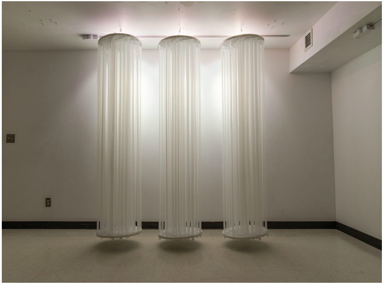
floating pillars, 2014 plywood, polyethylene foam, paint