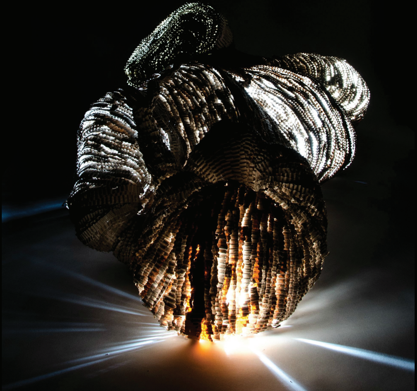
malformed hive, 2014 cardboard