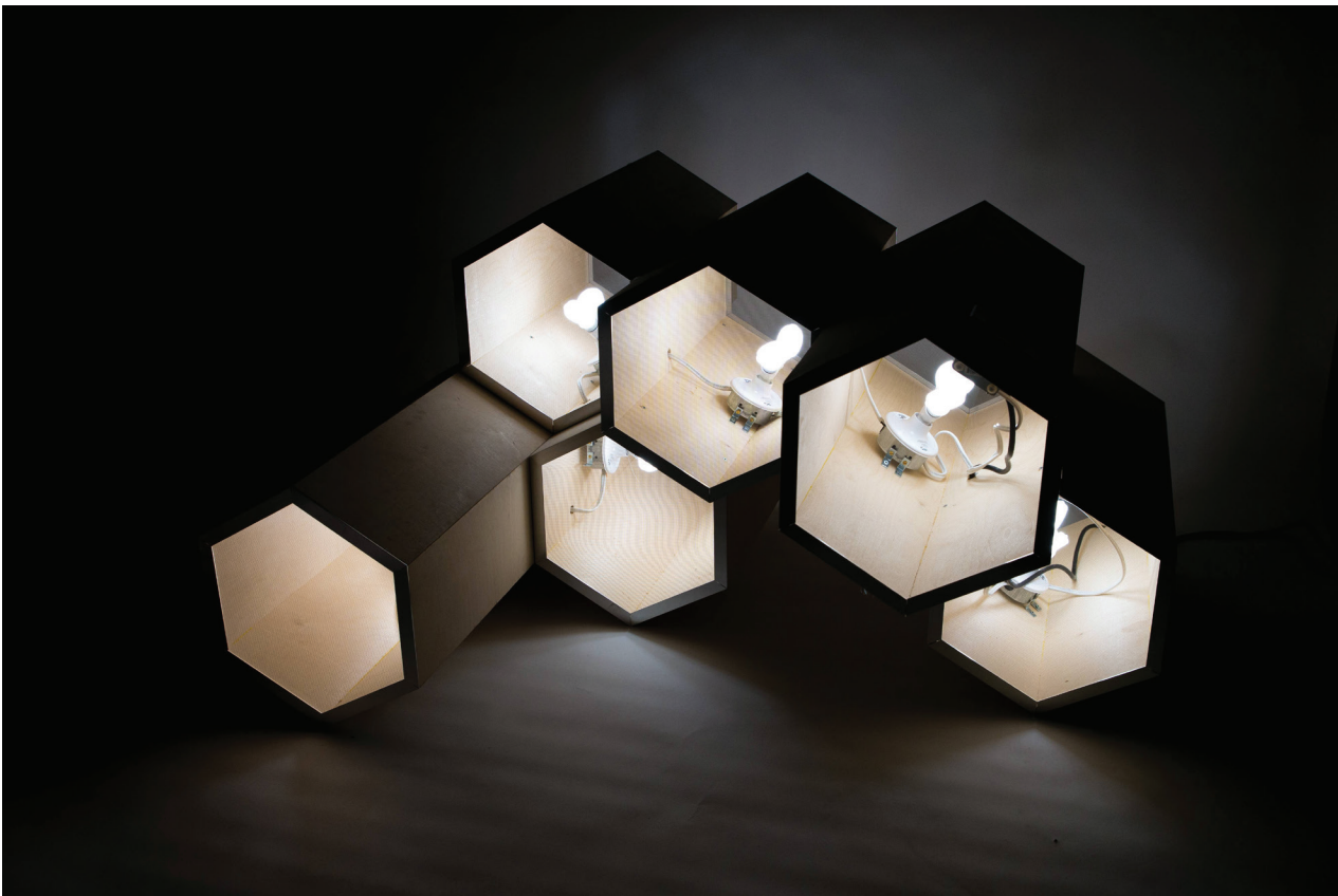
electric honeycomb, 2015 plywood, electrical components, aluminum