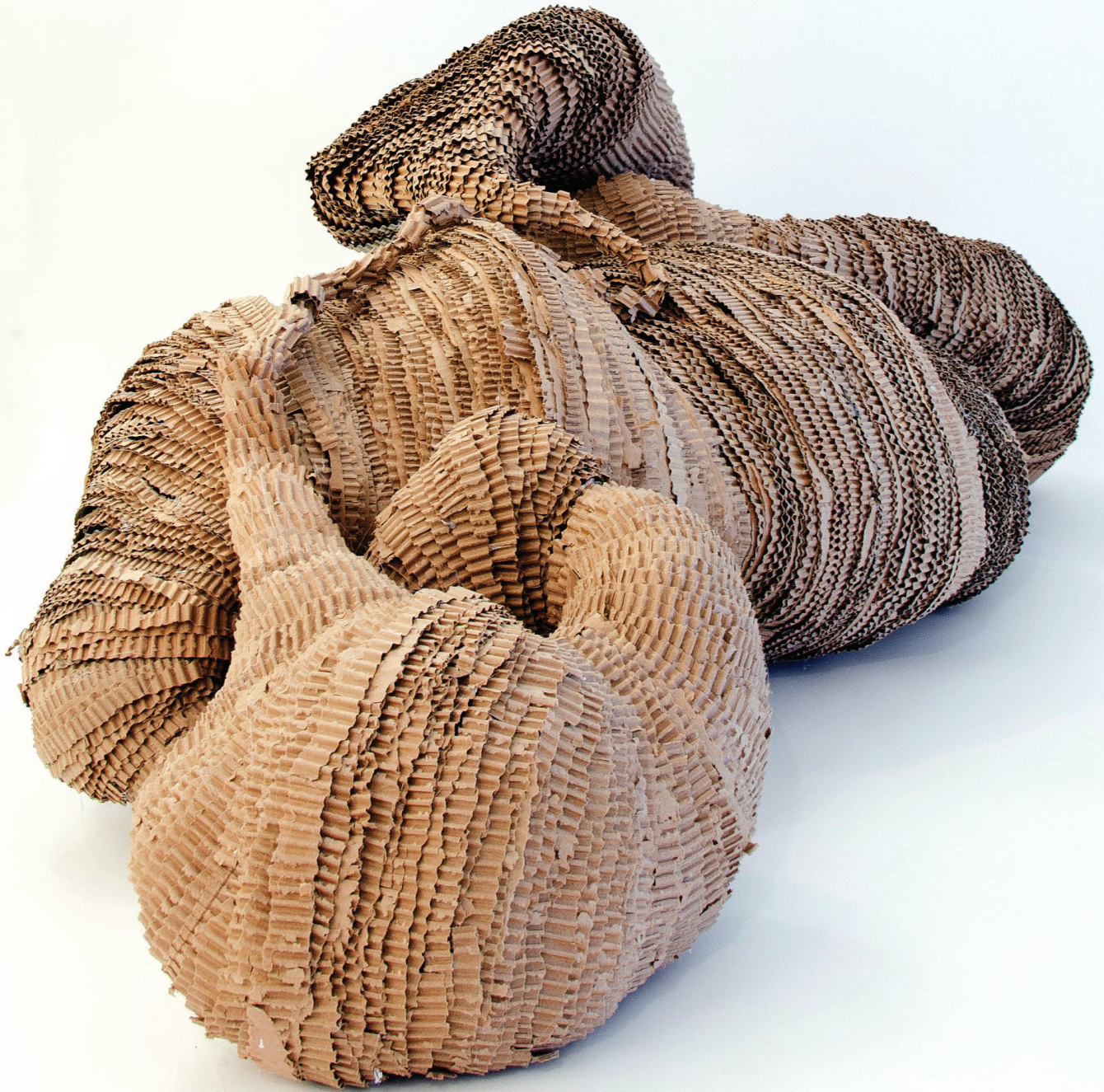
malformed hive, 2014 cardboard