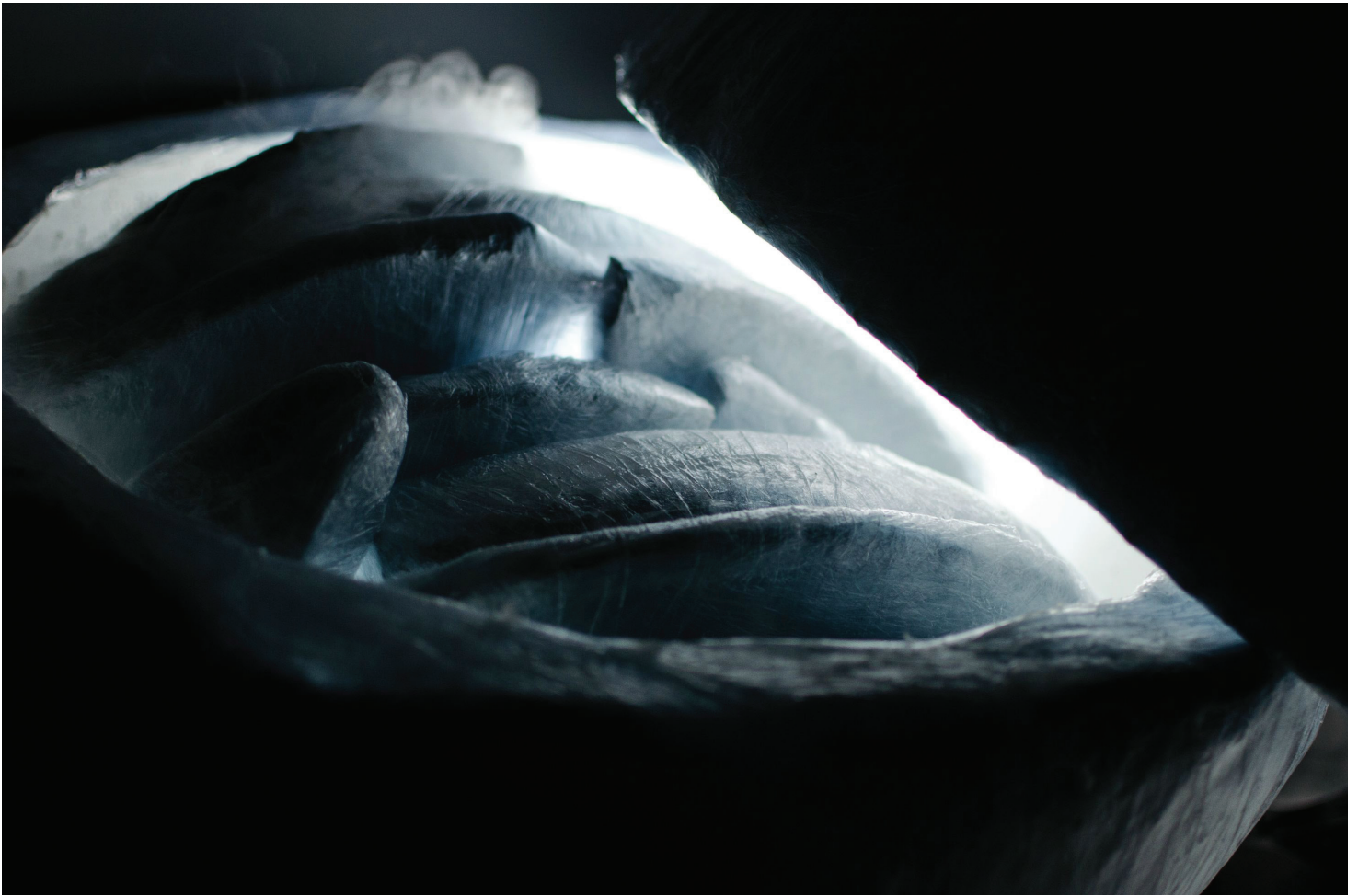
eclipse, 2014 plaster, burlap, aluminum foil, plastic wrap