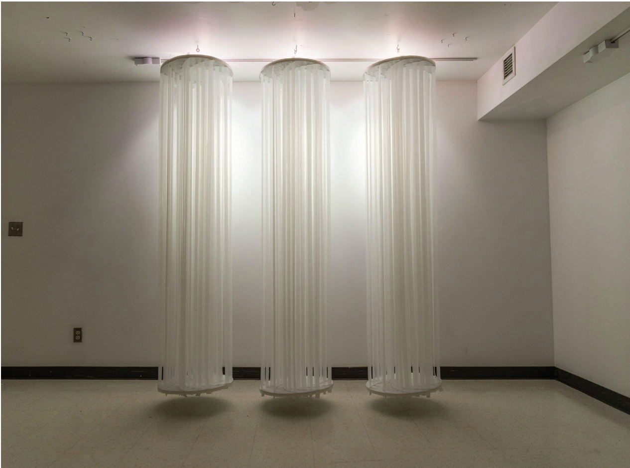
floating pillars, 2014 plywood, polyethylene foam, paint